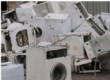
LARGE NON-COLD HOUSEHOLD APPLIANCES (excluding refrigeration)