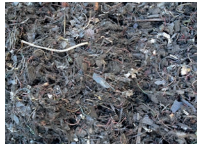
SHREDDER WIRES / ACSR