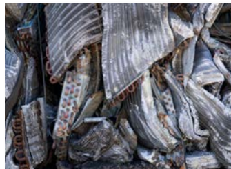
CU / AL RADIATORS