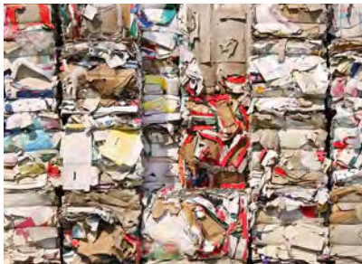
PAPER / CARBOARD