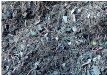
ASR / SHREDDER WIRES