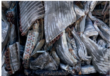
CU / AL RADIATORS